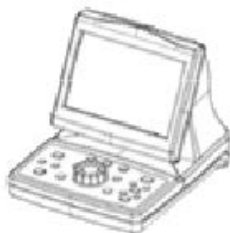
Computerized vision tester